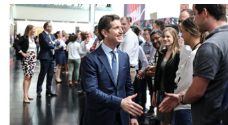
Alex Gorsky meeting with employees on his visit to Australia.

To ensure we're always investing for the future and keeping the long-term view, we're participating in important initiatives like the Embankment Project for Inclusive Capitalism, CECF's Strategic Investor Initiative and the U.S. Business Roundtable. With these expert partners, we're helping to shift the conversation in the financial markets toward a long-term view and measurement of the value to society that a business like ours creates.