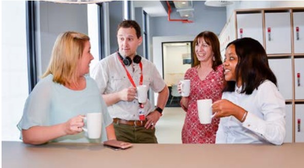
Johnson & Johnson employees in our new facility in Midrand, South Africa

In 2019, we advanced responsible business practices across a range of topics relating to ethics and transparency (compliance, bioethics, information security and data privacy, and corporate governance) and product quality, safety and reliability (product quality, patient safety, ingredient safety and combating counterfeiting and illicit trade). We also made notable progress in empowering people and leading a responsible supply base .