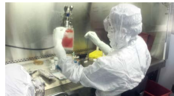
Janssen's new cell processing facility in Raritan, New Jersey, where a carefully controlled, aseptic environment was designed for the groundbreaking CAR-T cancer therapy, in which a patient's own T-cells are reengineered to create a personalized treatment to fight cancer.