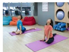
Employees in our Seoul office participating in a group yoga class.

Launched the J&J Innovation Champions program offering R&D scientists a six-month secondment to an external innovation organization