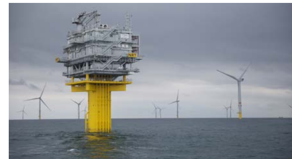
© North Sea wind farm off the coast of Belgium and the Netherlands provides renewable energy for our operations in both countries.