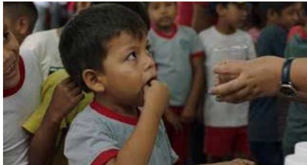
A child in Peru takes a VERMOX CHEWABLE tablet to treat intestinal worms, donated by Johnson & Johnson and implemented by INMED Partnerships for Children as part of a national mass drug administration.

We go the extra mile to support the people at the front lines of delivering care, so that communities can more effectively address the health needs of the world's most vulnerable people. Examples from 2019 include: