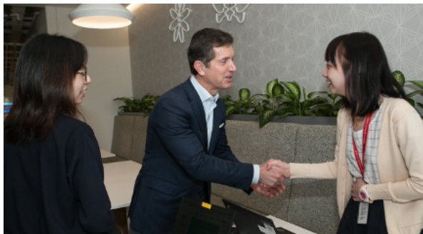
Alex Gorsky meeting with employees on his visit to Singapore in 2019

We saw unprecedented innovation and encouraging progress toward meeting some of the world's most urgent health challenges—all while grappling with increased pressures on our healthcare systems, and sociopolitical upheaval that added complexity to coordination of public health efforts. By the end of 2019, while we were seeing only the first glimpses of the outbreak of the coronavirus disease (COVID-19), it was already evident just how necessary it was to mobilize resources on a global scale when combating outbreaks of infectious disease.