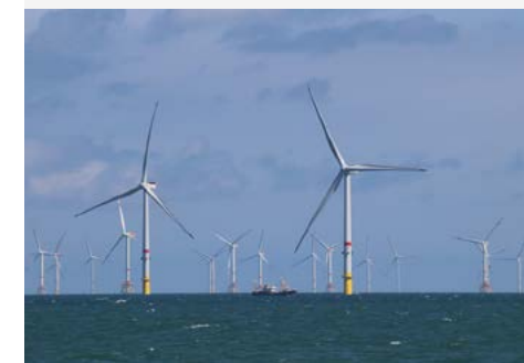
© Norther wind farm off the coast of Belgium and the Netherlands provides renewable energy for our operations in both countries.

32% reduction in CO 2 emissions since 2010