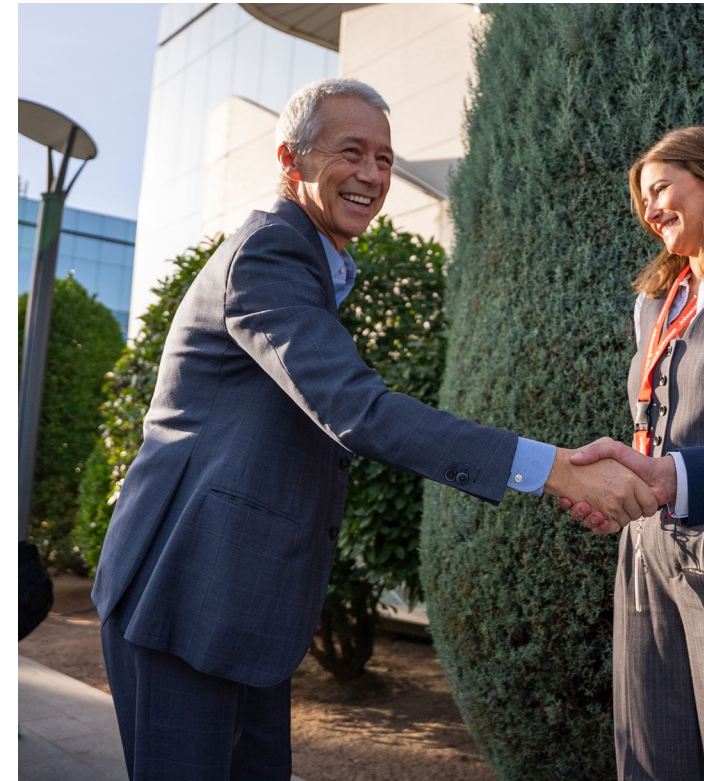
Joaquin Duato, Chairman of the Board and Chief Executive Officer

I invite you to explore the full report for more information on how our teams are translating Our Credo into action around the world.